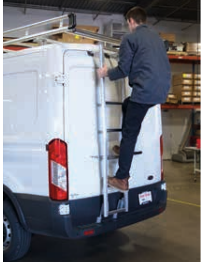
Easily access cargo on the roof.