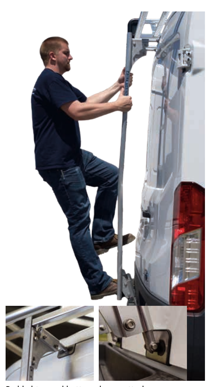
Padded top and bottom clamps attach to door edges, all without drilling.