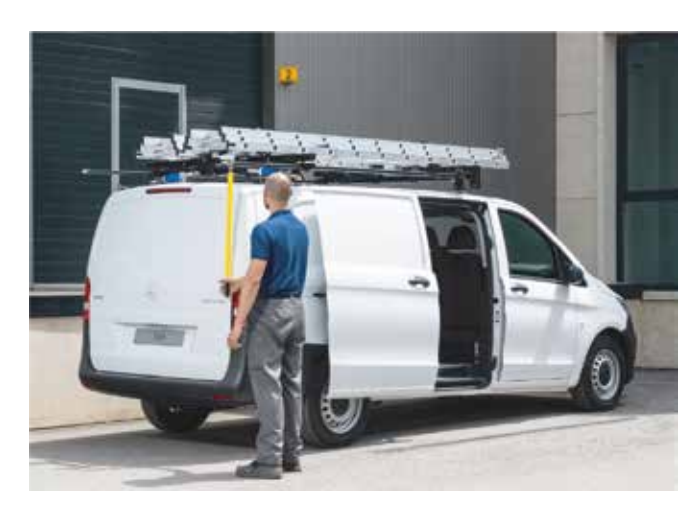
5. The Auto Clamp secures the ladder without additional straps or clamps.