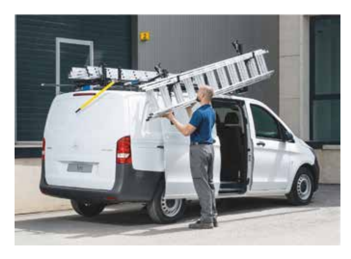
2. Lift the rear end of the ladder on to the rear hook.