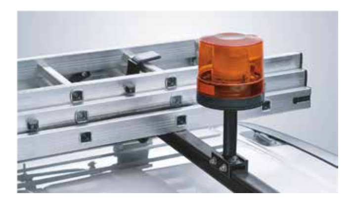
BEACON MOUNTING BRACKET

Accessories+ allows you to set up ErgoRack for your specific job. All products are made from 100% aluminum and ABS.