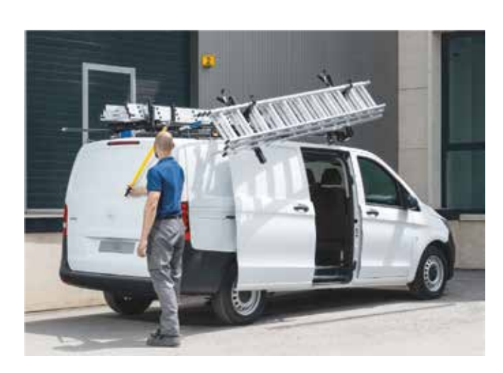
3. For high roof vehicles: lift the slide upwards until it is locked position.