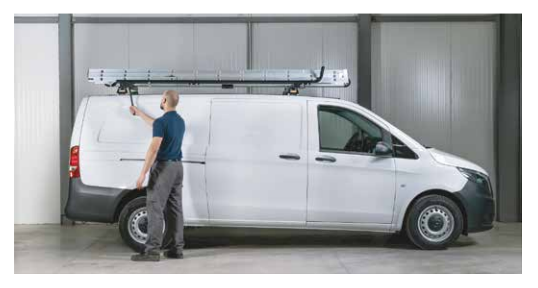
3. Turn the handle to swing the hook upward and clamp the ladder tightly into place