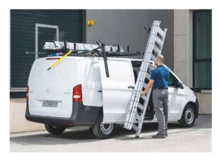
1. Position the ladder in the front hook, without lifting the ladder.

Regardless of the height of the vehicle, the PDE ladder lifts allow for easy, fast and safe (un)loading of any ladder. The hydraulic cylinder regulates the glide speed, slowing the movement of the ladder lift for smooth operation by the user.