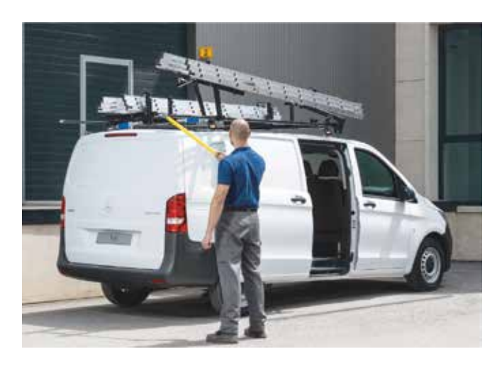
4. Pull the handle to rotate the ladder onto the roof walking backwards with your arm straight