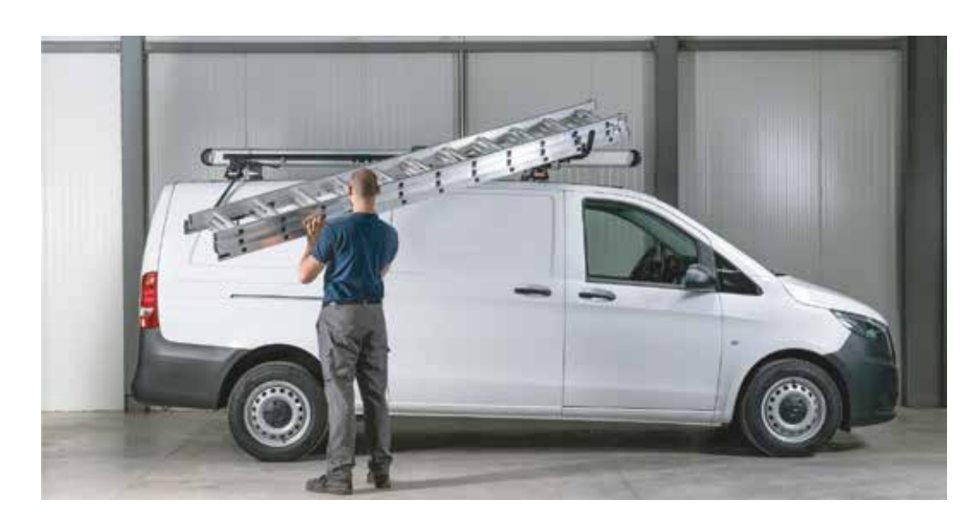
2. Lift the ladder onto the rack