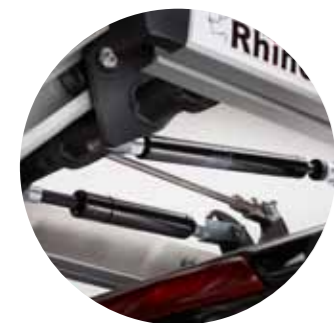
Gas-assisted lifting - safe, ergonomic ladder handling